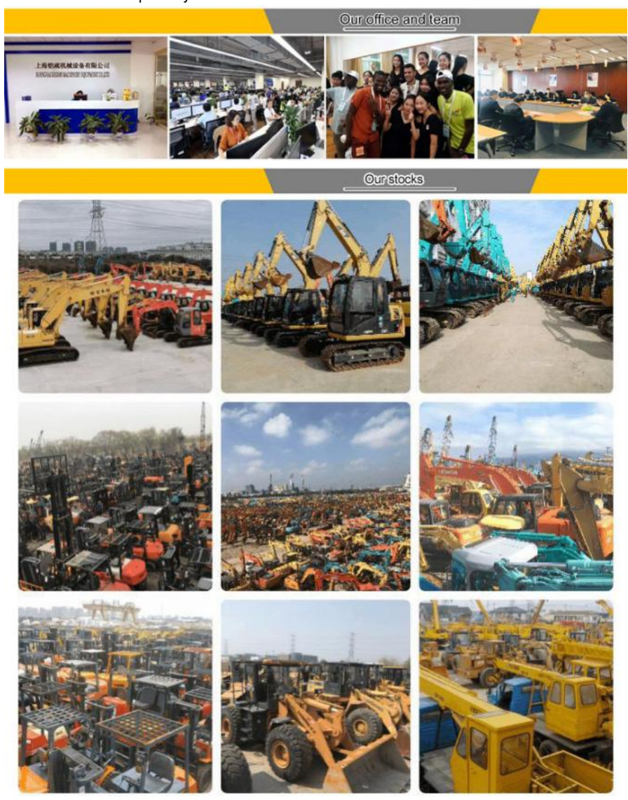
Our transaction case

In order to serve our customers better, we deal in three(3) thousand units of construction machinery all year round and ensure delivery within 7-30 days after payment. Our team can serve you around the clock (24/7) and we hope to build a long-term business relationship with you.