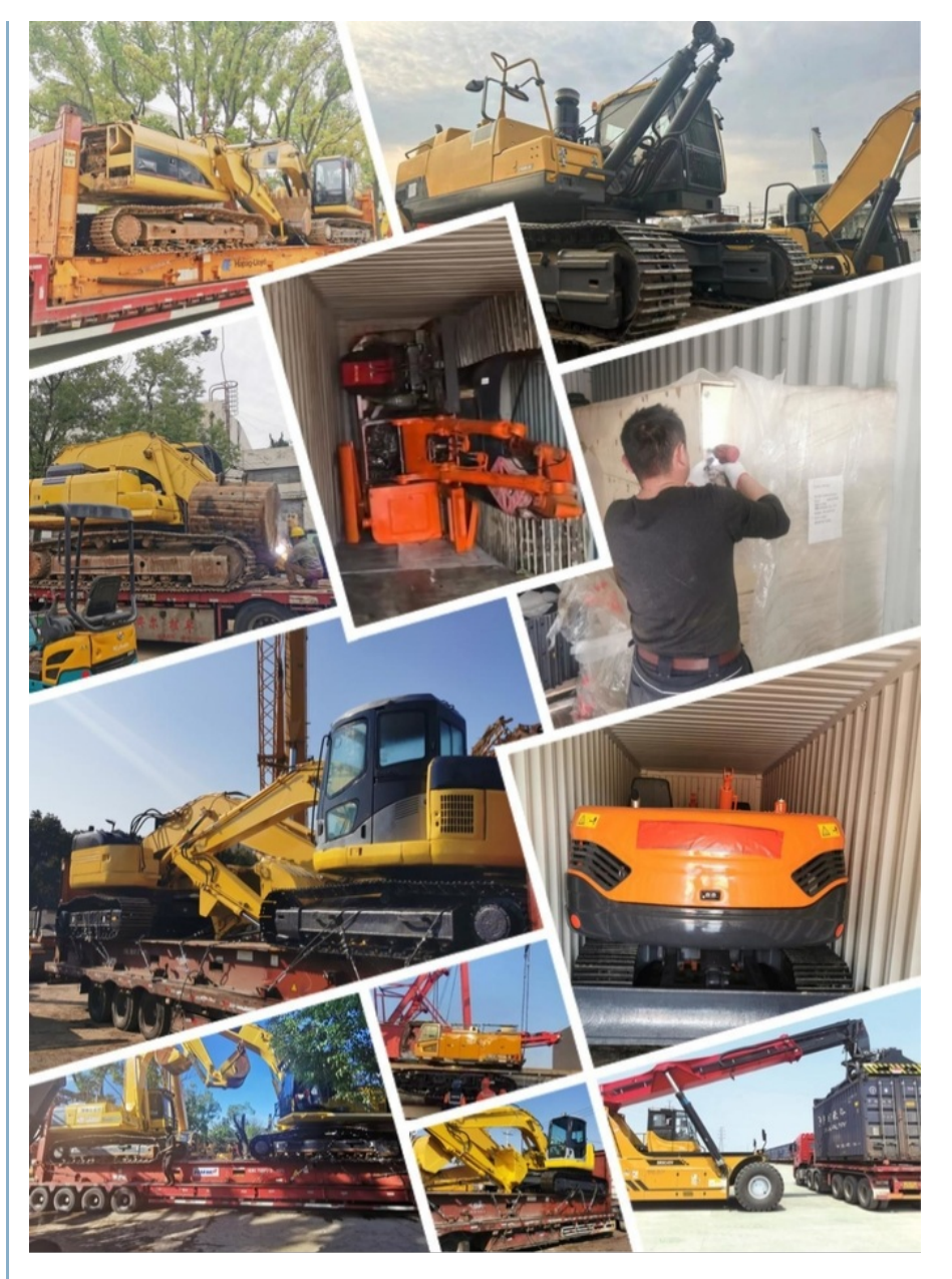
Accessories we can supply