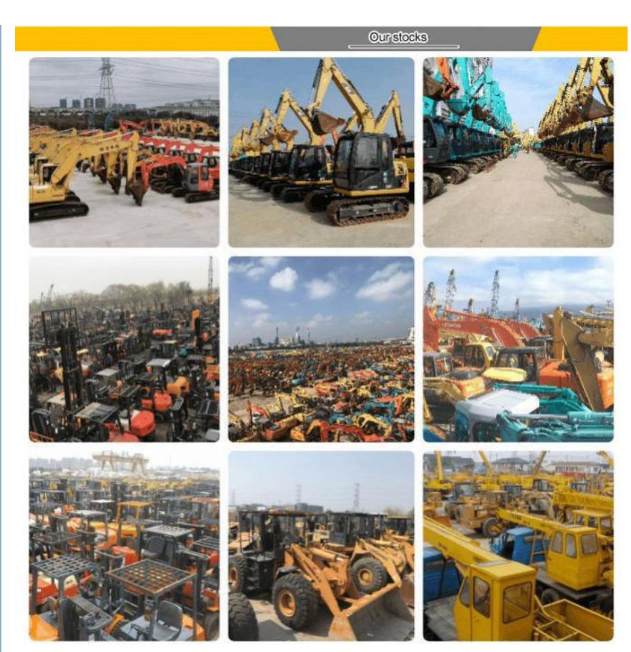
Our transaction case