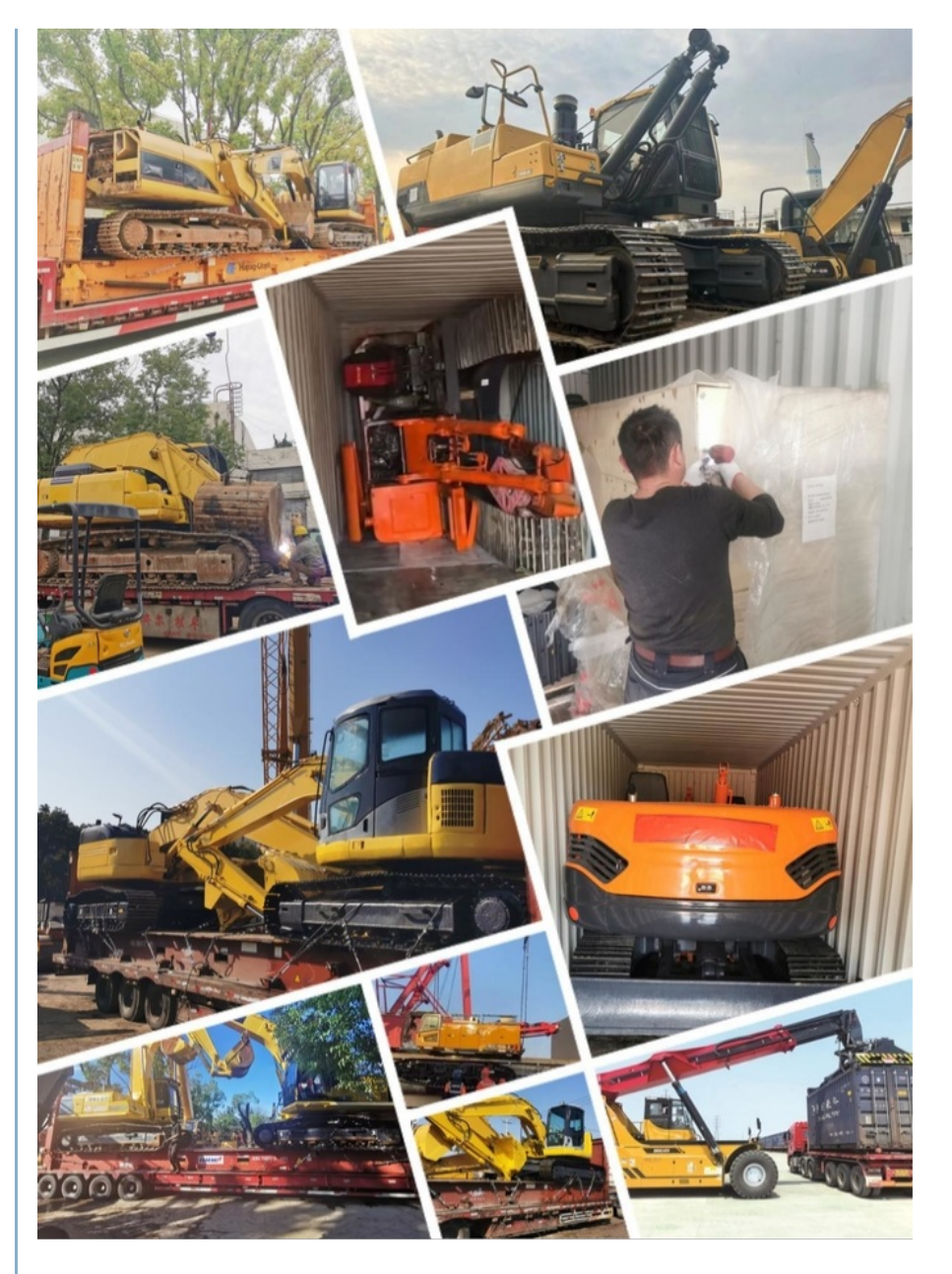
Accessories we can supply