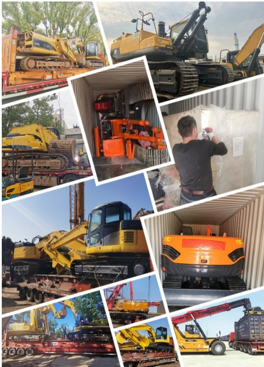
Accessories we can supply