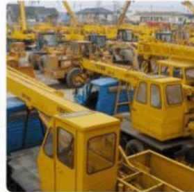
Our transaction case