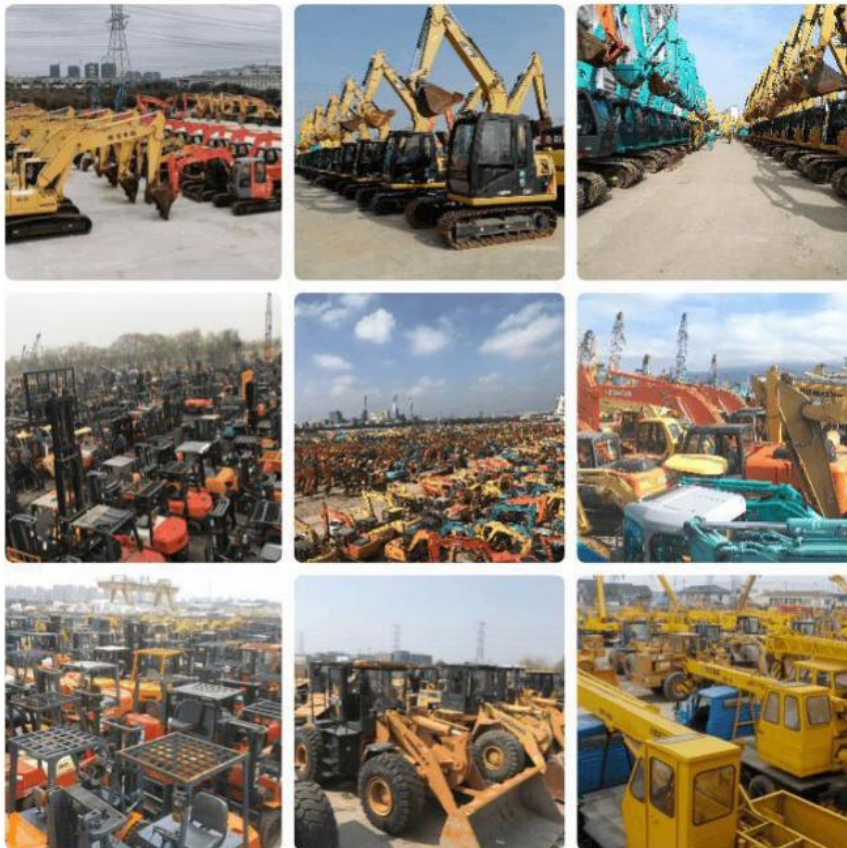
Our transaction case