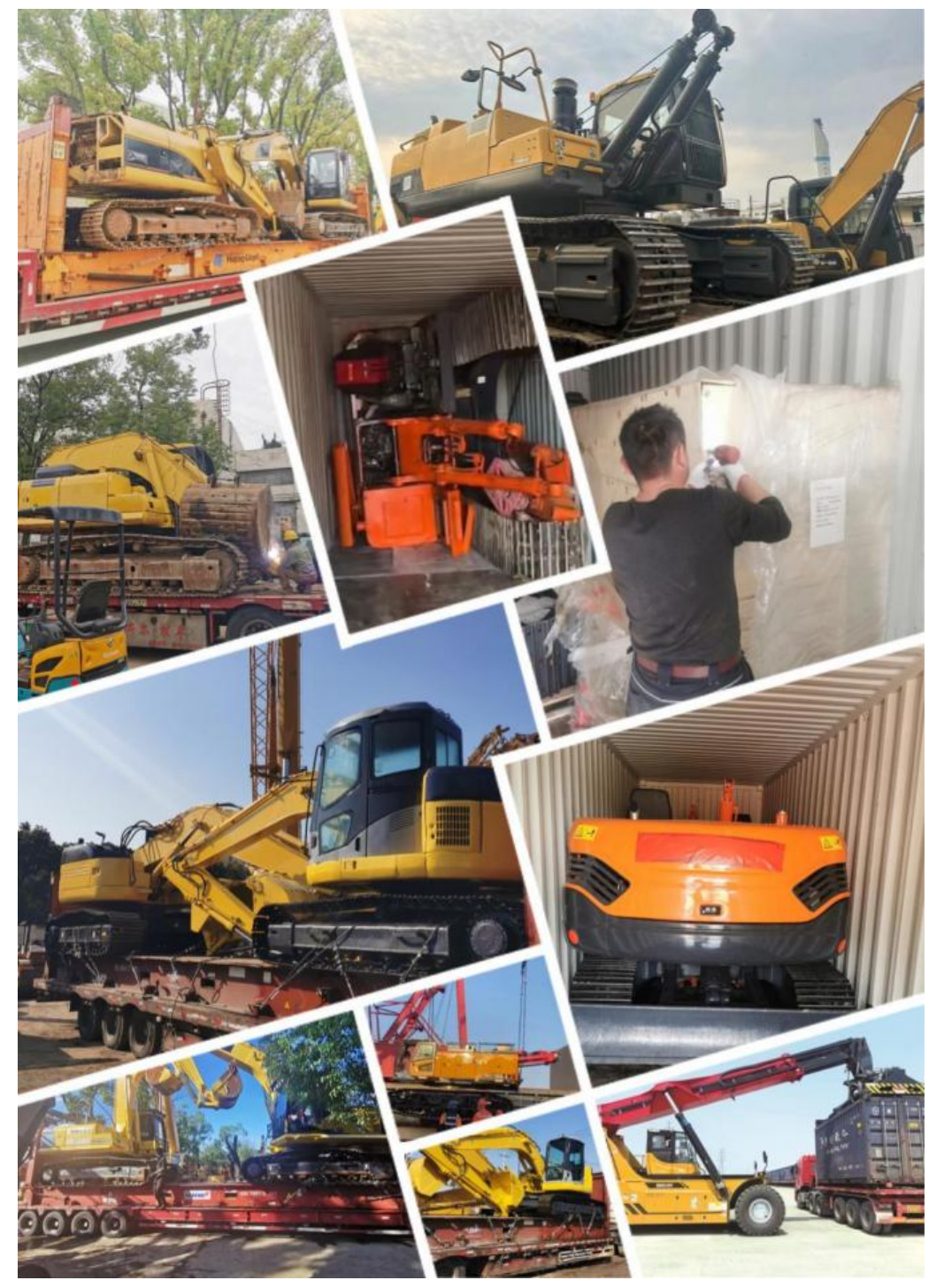
We can provide other accessory devices